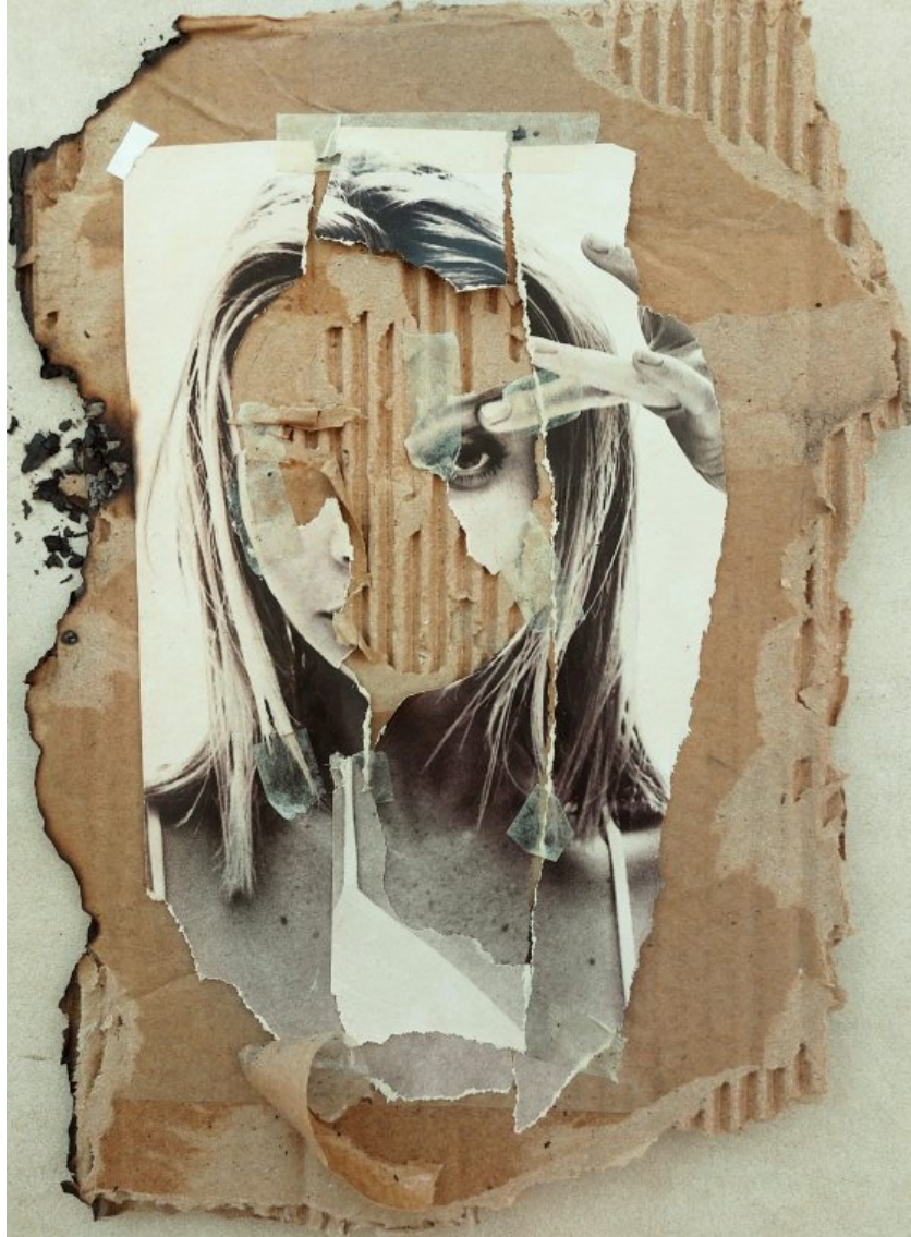
OLGA NIKIFOROVA Smoldering, 2023 Paper, cardboard 31 x 24 cm (h x w)