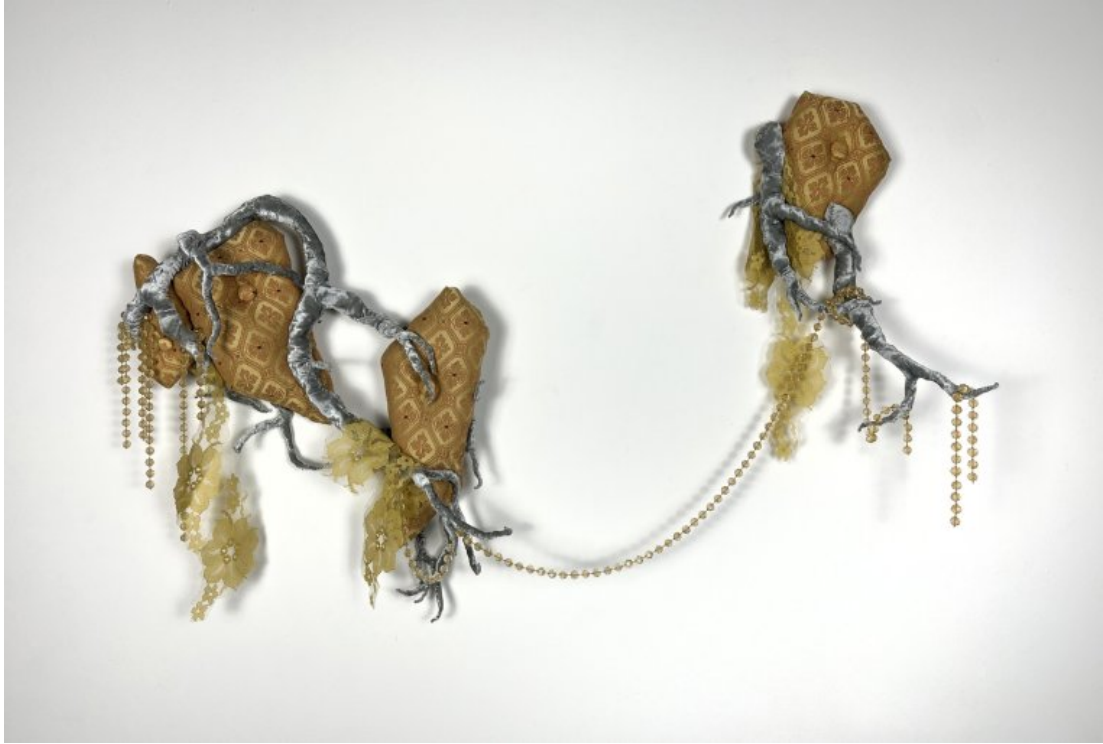
STACY ISENBARGER Cooling System, 2023

Low relief upholstered forms, rope, hand stitched velvet, beaded cord, lace 23 x 36 in (h x w)