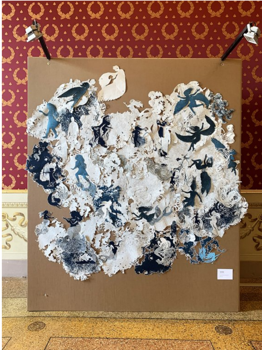
JENNY LEE ROBINSON Lucca, 2022

Screenprinted and hand-cut papers fixed to a cardboard exhibition portable walls with pushpins and magnets 200 x 160 cm (h x w)