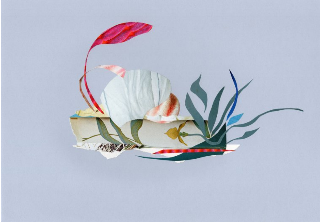
AGATA BOROWSKA Untitled, 2023 Collage 21 x 29.7 cm (h x w)