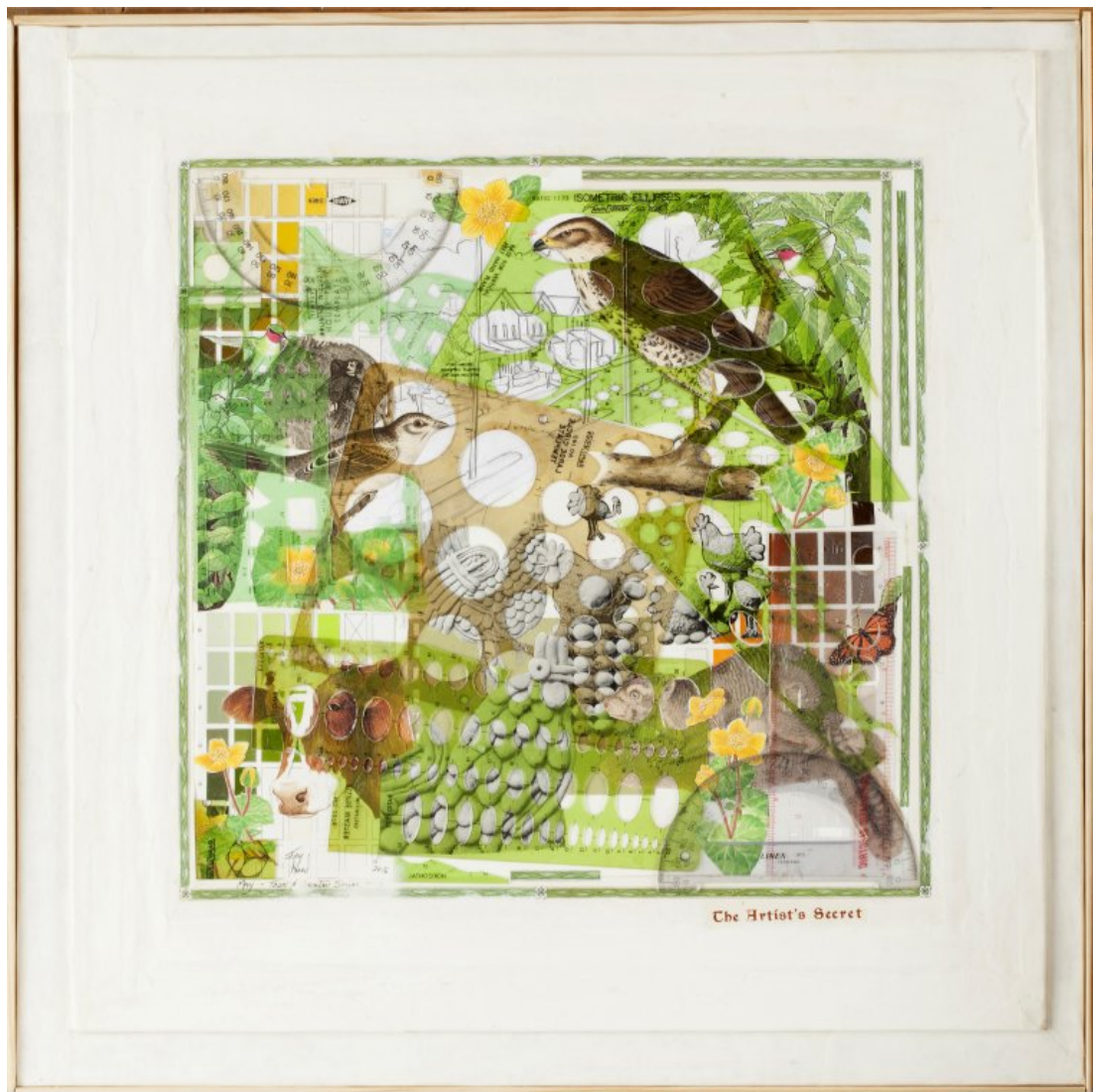
FAY WOOD The Artist's Secret Collage 24.5 x 24.5 in (h x w)