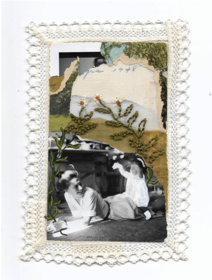
TWIGGY BOYER Catching Light, 2023

Mixed media collage & embroidery on vintage fabrics 6 x 4 in (h x w)