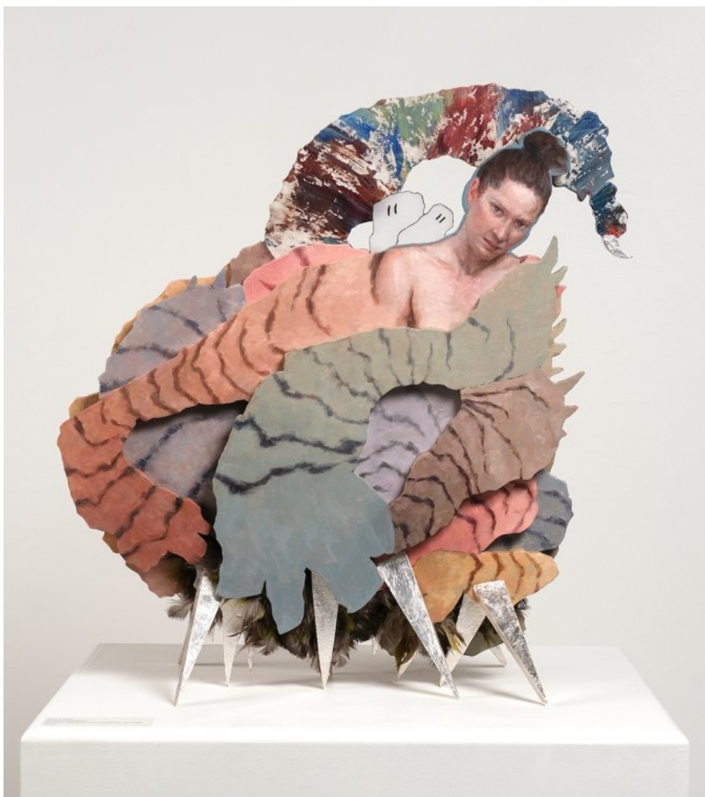
AMY J. DYCK Scorpion, 2022

Oil paint on layered plywood, with genuine silver leaf, feathers, plexiglass 24 x 24 in (h x w)