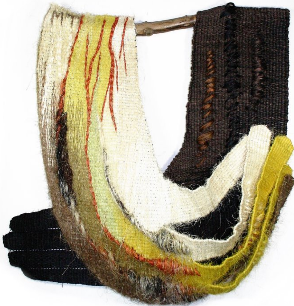
MARIETA TONEVA Hands VIII, 2019 Fiber art 100 x 100 cm (h x w)