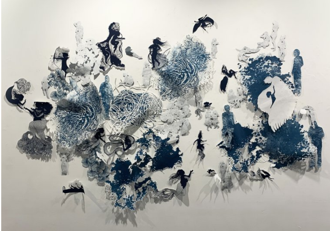
JENNY LEE ROBINSON Beeum Gallery, 2022

Screenprinted and hand-cut paper, fixed to a wooden wall with nails and magnets 180 x 250 cm (h x w)