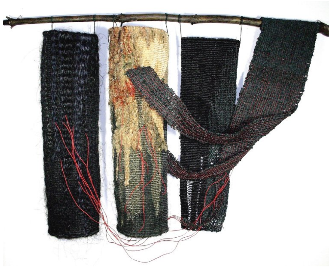
MARIETA TONEVA Trinity, 2020 Fiber art 90 x 135 cm (h x w)