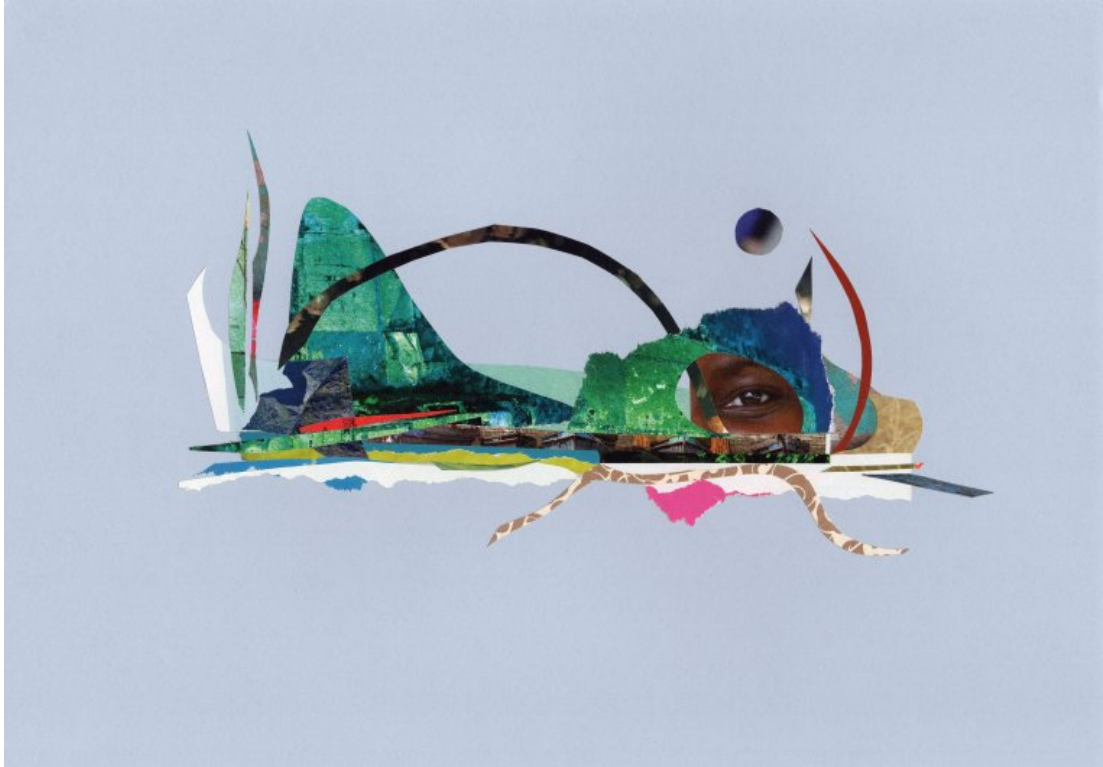
AGATA BOROWSKA Untitled, 2023 Collage 21 x 29.7 cm (h x w)