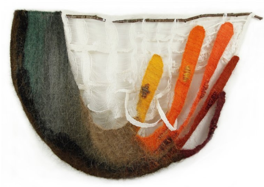
MARIETA TONEVA Hands X, 2020 Fiber art 135 x 210 cm (h x w)