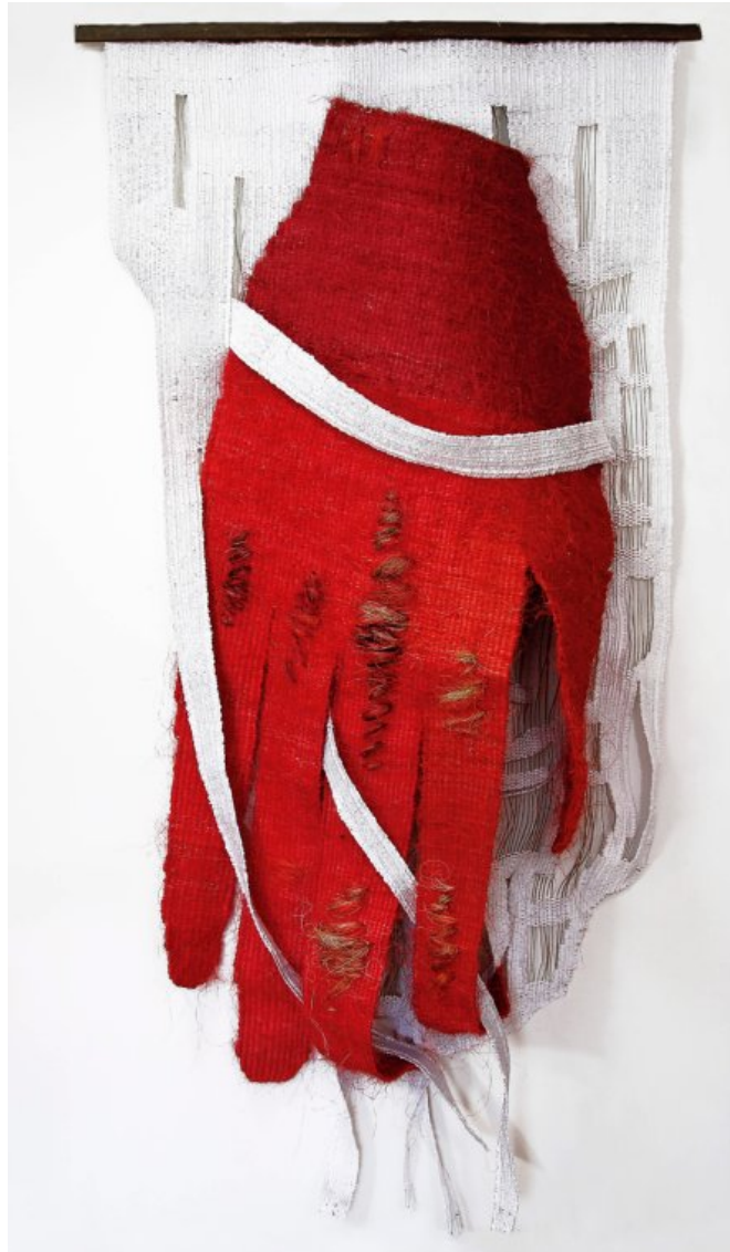
MARIETA TONEVA Hands IX, 2019 Fiber art 235 x 80 cm (h x w)