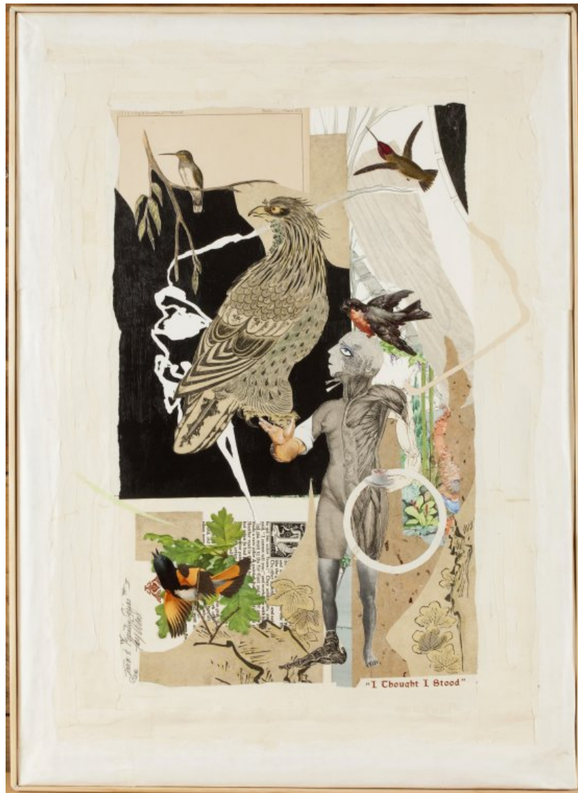
FAY WOOD I Thought I Stood Collage 28 x 21.5 in (h x w)