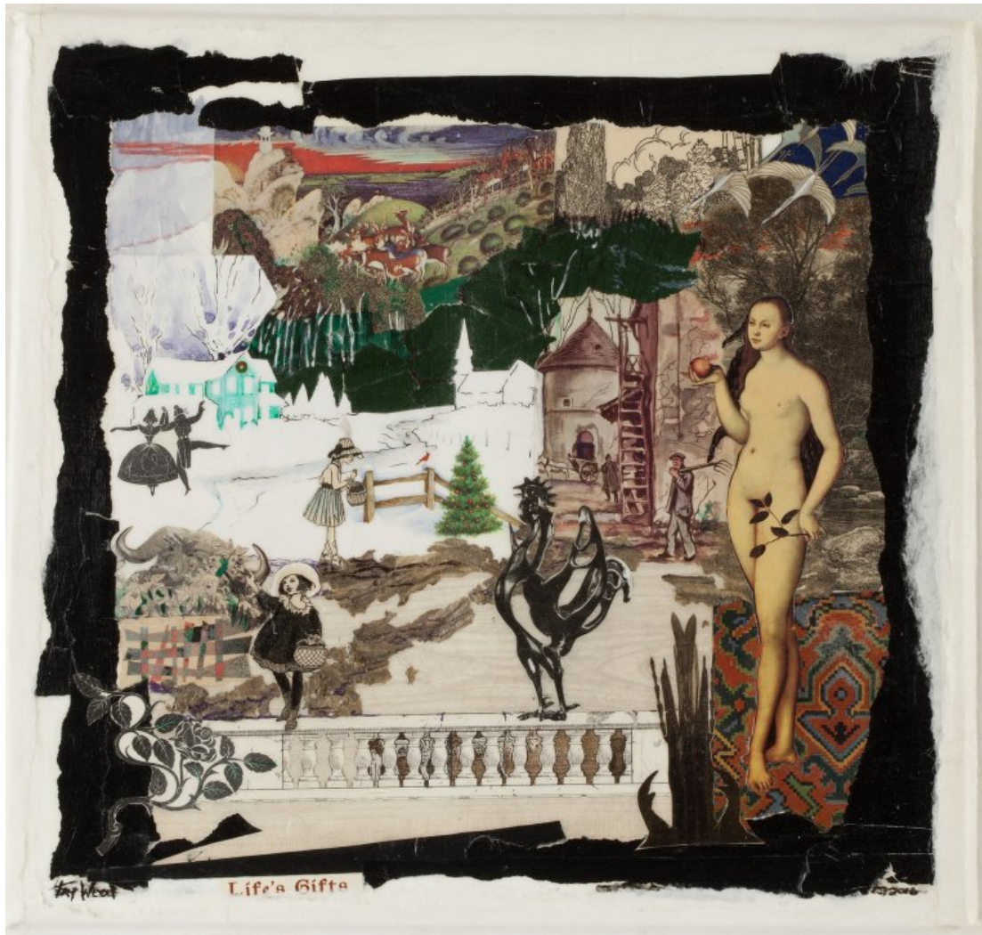
FAY WOOD Life's Gifts Collage 20.5 x 20.5 in (h x w)