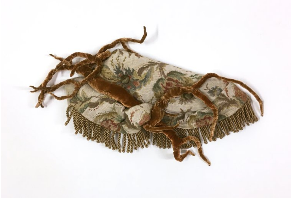
STACY ISENBARGER Relieving (Gabe's Palm), 2021 Low relief upholstered form, rope, velvet 12 x 22 in (h x w)