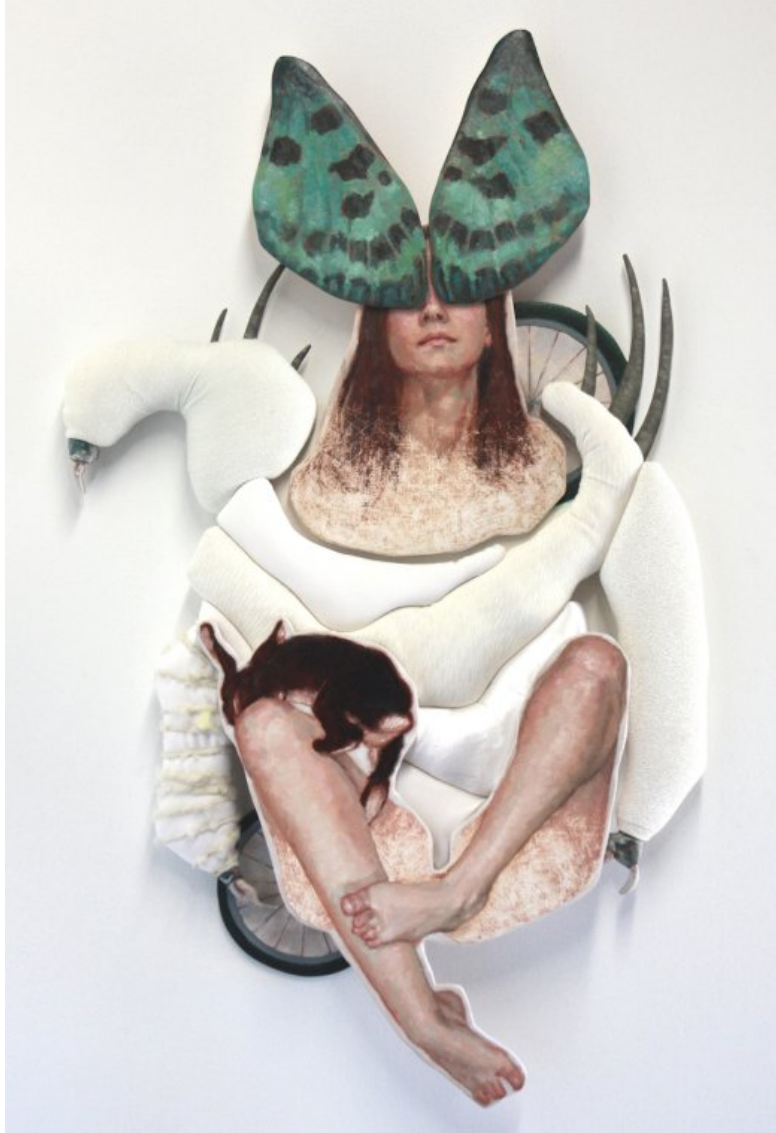
AMY J. DYCK Wheel And Wings, 2023 Reclaimed fabrics, foam, oil paint on wood 31 x 19 in (h x w)