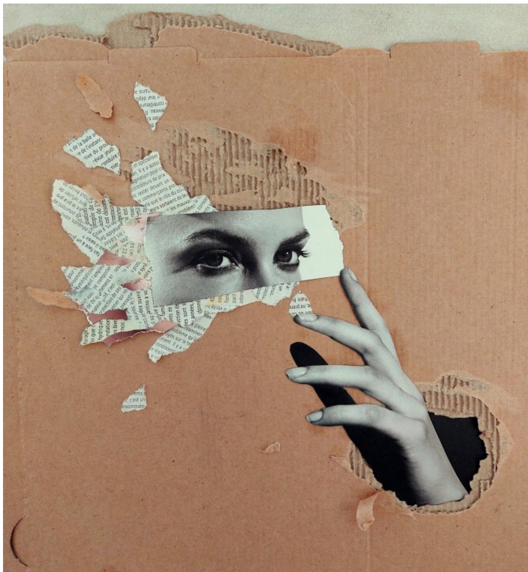
OLGA NIKIFOROVA Because It Hurts, 2023