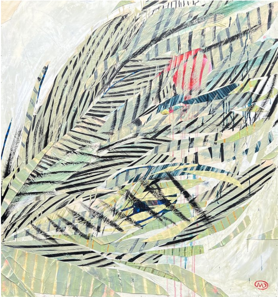
MEGHAN DEROMA Messenger, 2022

Acrylic, gouache, found paper, personal ephemera on wood panel 52 x 48 in (h x w)