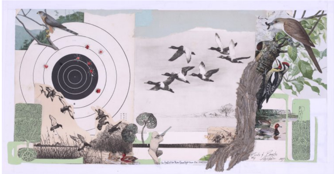
FAY WOOD Birds & Beasts Collage 18 x 38 in (h x w)