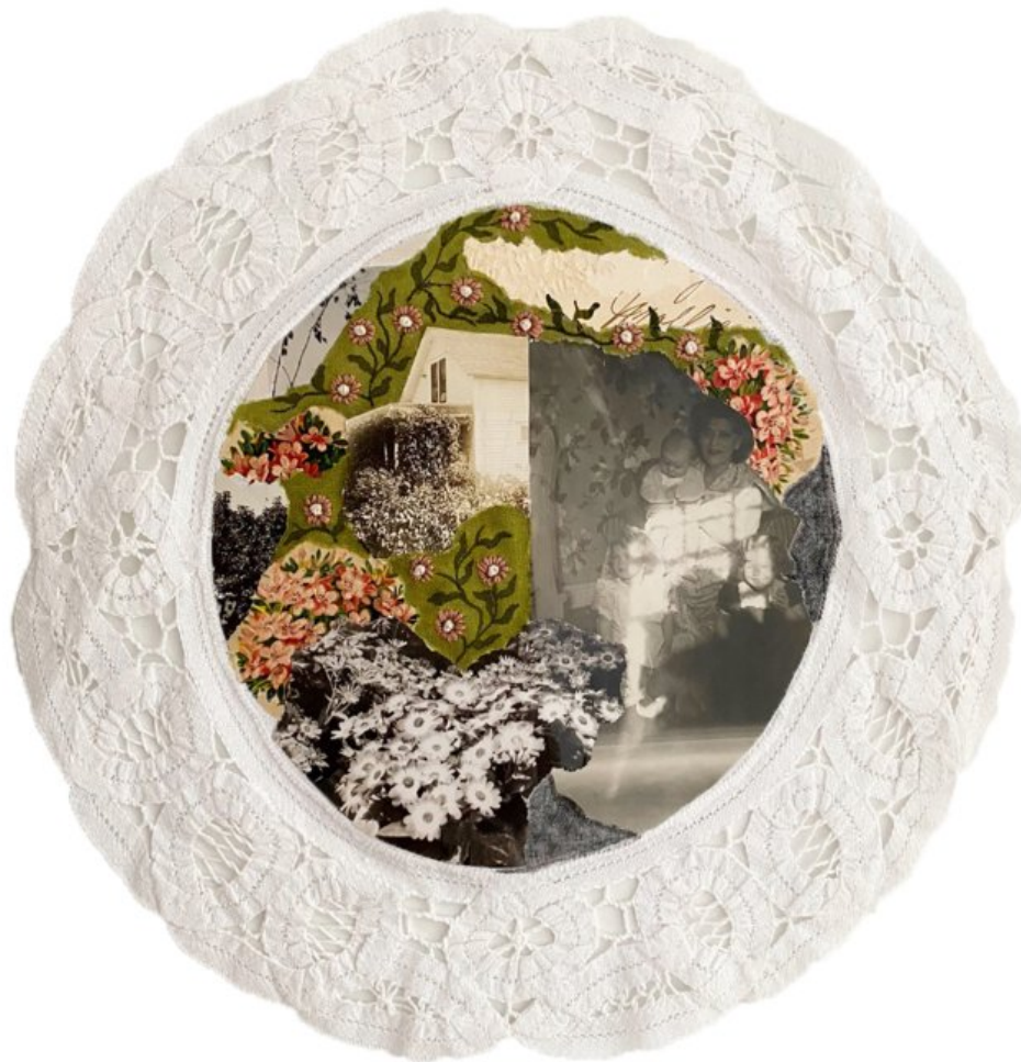
TWIGGY BOYER Light Of My Life, 2023

Mixed media collage & embroidery on vintage fabric 10 x 10 in (h x w)