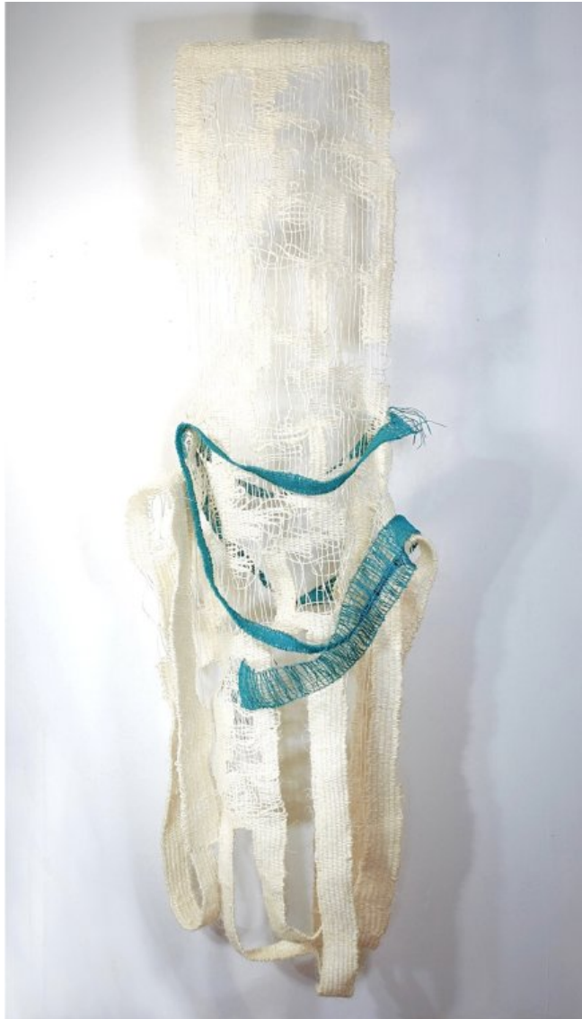
MARIETA TONEVA Stillness, 2019 Fiber art 190 x 65 cm (h x w)