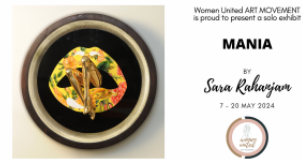
SARA RAHANJAM New Love, 2015 Sculpture 50 x 50 cm (h x w) $ 4,000